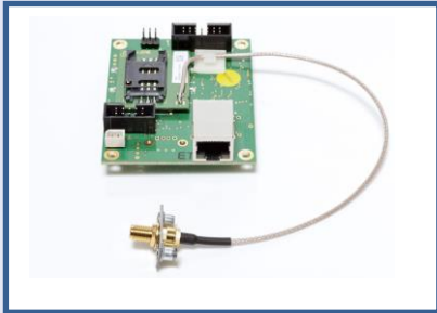
Web server – Web server + GSM